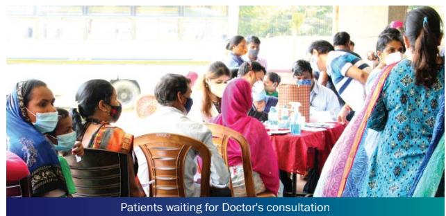
Patients waiting for Doctor's consultation