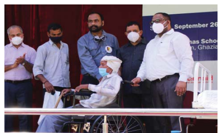
Distribution of Medical Beds and Wheelchairs