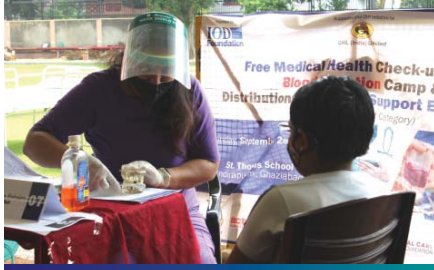
Dentist displaying appropriate teeth brushing technique to patient