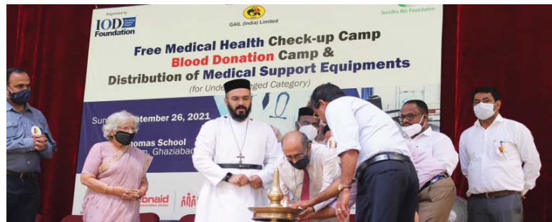
Lighting of the lamp by Dignitaries