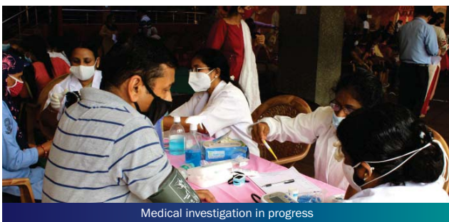
Medical investigation in progress