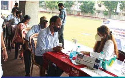
Patients consulting General Physician

The specialized doctors from Eye, ENT, Dentists, General Physicians, Homeopathy, General Medicine & Pain diagnosed the patients. Blood diagnosis was also done at the camp. Health awareness program was also part of this camp at the same venue. More than 500 people from the surrounding area of Indirapuram, Vaishali, Vasundhara & Loni were benefited through this camp. Medical camp was conducted under all Covid-19 protocols.