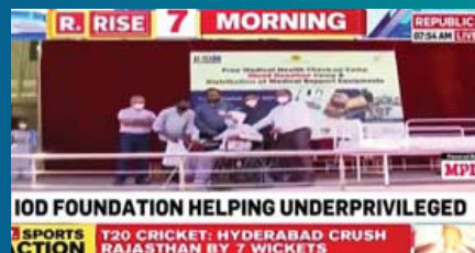
Coverage of event by Republic TV