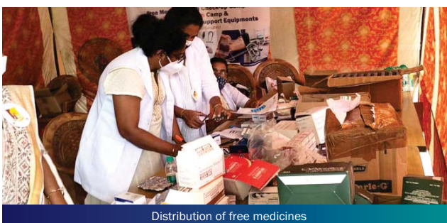
Distribution of free medicines