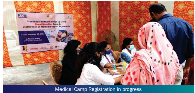
Medical Camp Registration in progress