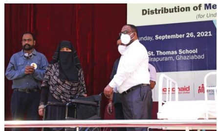
Distribution of Medical Beds and Wheelchairs