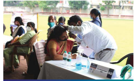
ENT specialist examining patient