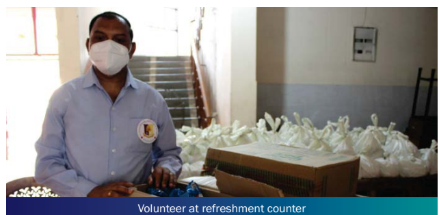
Volunteer at refreshment counter