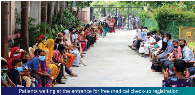
Patients waiting at the entrance for free medical check-up registration

At the entrance of the medical camp, blood pressure, oxygen level, body temperature and sugar level were checked of all the patients. Free medicines and refreshments were also distributed. Doctors and medical staff were provided with face shields, sanitizers, medical gloves & N95 masks for complete protection as per Covid-19 protocols. The program started at 10:30 am and ended at 2:30 pm.