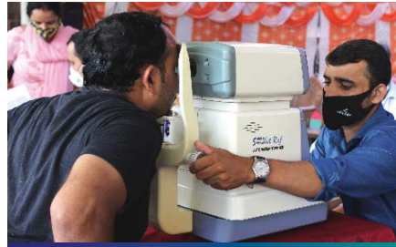
Eye Specialist examining patient