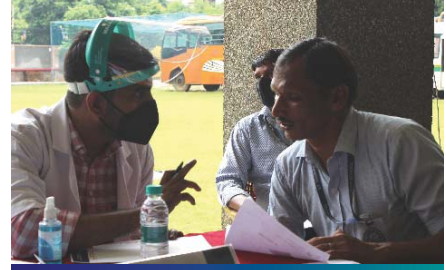
Patient consulting Dentist

A blood donation camp was also organized at the same place in association with Bharat Sewa Charitable Blood Centre . Huge number people donated the blood for this noble cause.