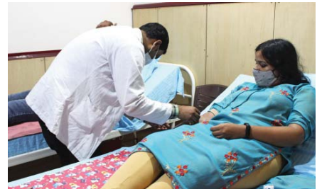
Blood Donation Camp at the venue

Medical support Equipment's ( wheelchairs & medical beds ) were also distributed to the most deserving people of the society was one of the highlight of this program. 38 physically challenged people were benefited through this initiative.