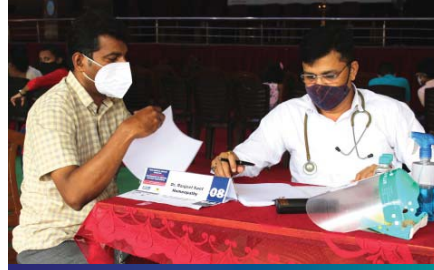
Homeopathy specialist diagnosing patient